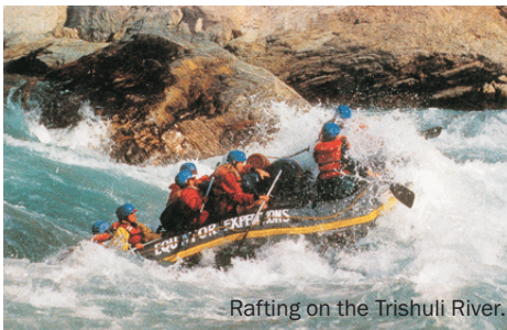
Rafting on the Trishuli River.

Early morning drive to Chitwan National Park (160 km). The drive to rafting put-in-point takes about 2 and half hours. Briefing will be done by trained river guides. Enjoy white-water rafting for about 2 hours, lunch is served by the river-bank. We have another 2 hours drive to the national park. Afternoon arrive at the park and experience elephant safari. Overnight stay at Gaida Wildlife Resort (B, L, D)